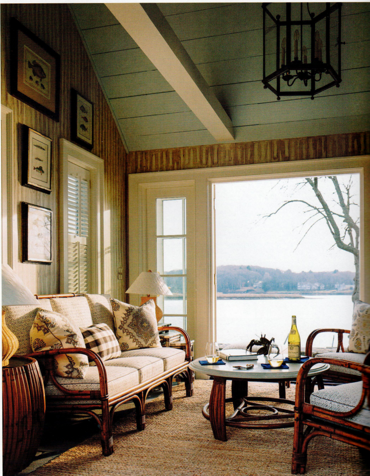
An existing outbuilding on the property—a perfect spot to enjoy a glass of wine—was reimagined into what the homeowners call the Summer House; the designers had the walls faux grained by a talented house painter. FACING PAGE: Two sets of French doors in the Summer House let warm breezes pass through from the Connecticut River to the garden.